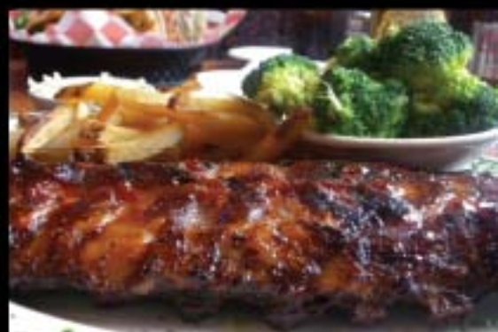
DAMON'S BABY BACK RIBS

Tender slices of flame grilled chicken, crispy bacon, mushrooms and spinach tossed in creamy Buffalo sauce on a bed of fettuccine topped with crumbled Bleu cheese - 13.99