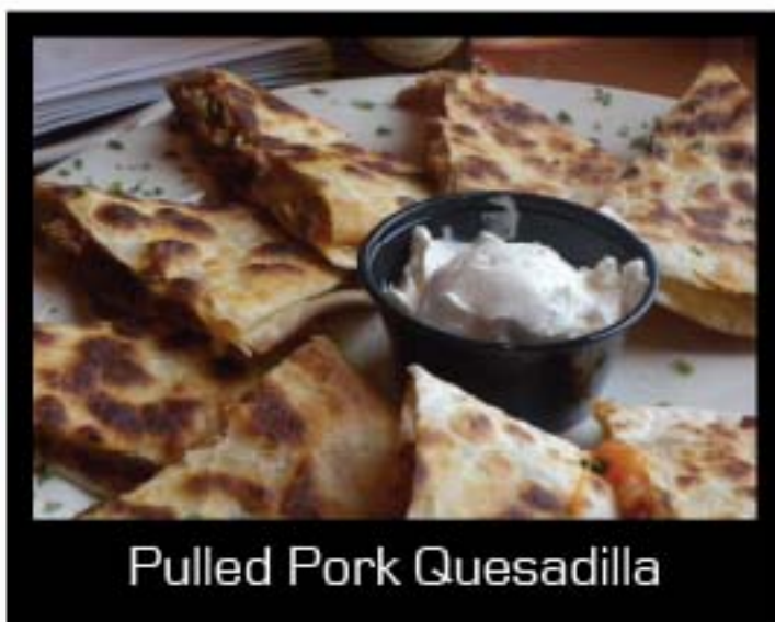
Pulled Pork Quesadilla

Southern BBQ pulled pork, Cheddar Jack cheese, tomatoes and scallions - 11.99