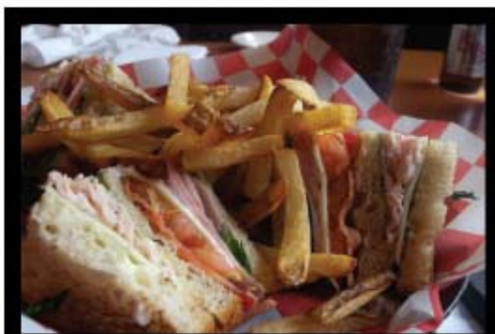
Double Decker Sandwich

Damon's Famous pulled pork BBQ grilled to perfection with cheddar cheese, coleslaw and our fresh cut fries. The Ultimate Grilled Cheese - 8.99