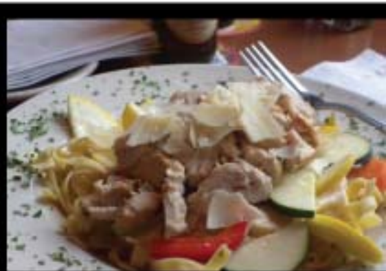
CHICKEN FETTUCCINI ALFREDO