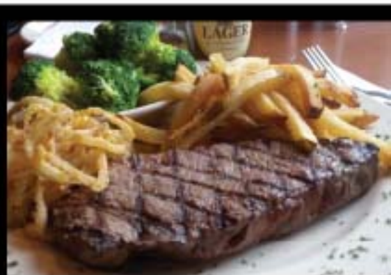
NEW YORK STRIP