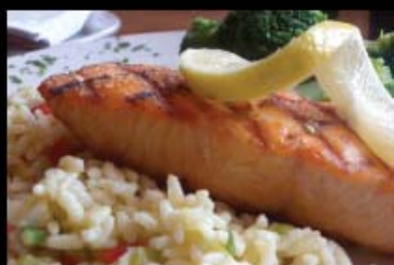
FLAME GRILLED SALMON